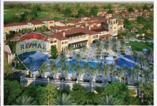
The view can be seen directly from Jumeirah